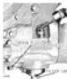
Figure 26-1-1—Diesel Engine Air Filter