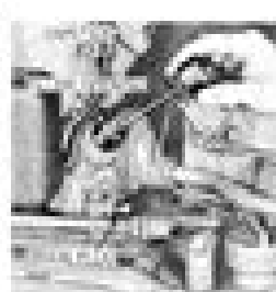
Figure 26-1-3—Diesel Engine Fuel Filter

If oil level is low in either engine, add sufficient good, clean oil to bring the level up to the "full" mark on the dip stick.