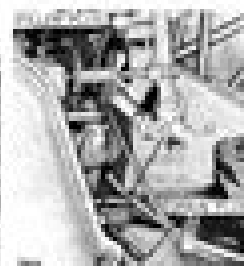
Cranking Engine Transmission Oil Plug