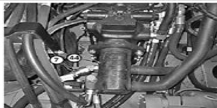
Hydraulic Pump Connections (S.N. —340401)