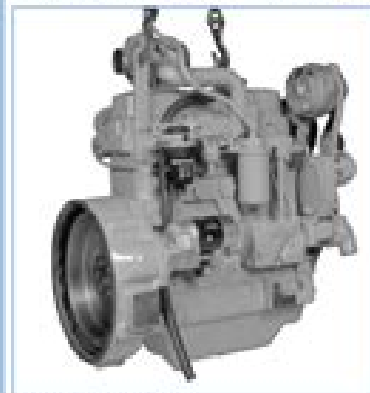
6068-019 3rd Right Rear View