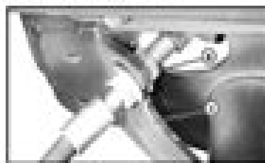
Left Hand Side Shown

4. Install lower rear cross member and secure with original hardware. Tighten to 37 ft-lbs (54 N-m).