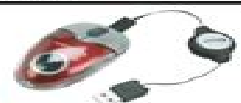
Mice & Peripherals