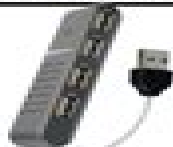
Mobile Products & Cables