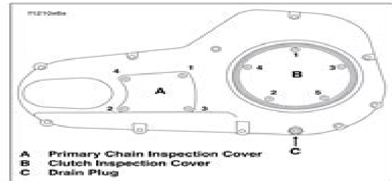
Figure 1-5. Primary Chaincase Cover