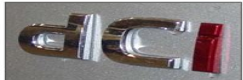
direct Common-rail injection

The 127 kW engine can be identified via the red coloured "I" in the "dCi" badge on the tailgate.