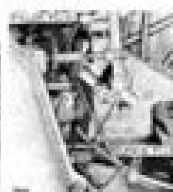
Charging Engine Transmission Oil Plug