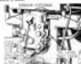
Figure 10-4-7—Fuel Tank Vent and Oil Level Vent

If the tractor is equipped with Power Shift, open the oil level vent (Figure 10-4-7) and see if it leaks out. If it does not, add good clean SAE 10 or 10-W oil until it does.