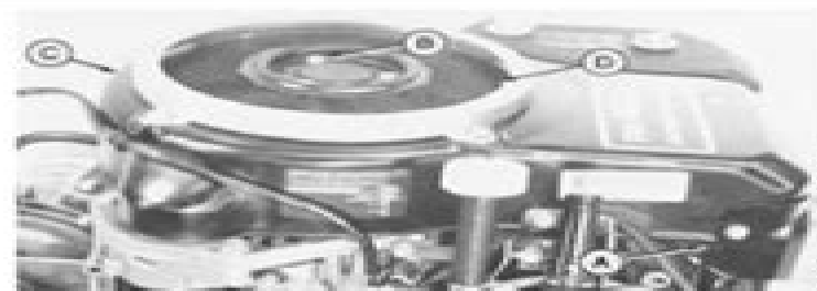
A—Cylinder Head Cover B—Flywheel Screen Screws C—Blower Housing D—Flywheel Screen