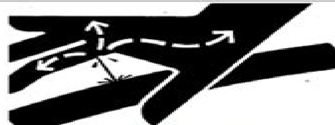
High Pressure Fluids

If ANY fluid is injected into the skin, it must be surgically removed within a few hours by a doctor familiar with this type of injury or gangrene may result.