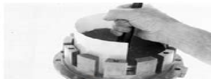
Brake Piston Installation

If Applicable—Slowly slide piston with eight spring pockets into position. Remove shim stock and puller. Install eight coil springs on piston.