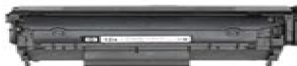
Figure 1: The HP 12A (Q2612A) toner cartridge