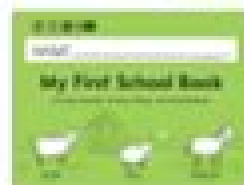
My First School Book Teach children pre-writing and capitals. MF5B-20