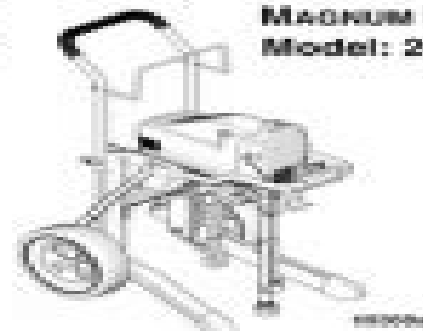
MAGNUM ProX9 Model: 261820