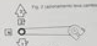
Fig. 2 serramento luci e cambio