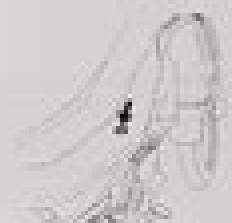
Fig. 3 pulsante di starter

Modelli TOP MISTRAL e CX è montato sul lato destro superiore della carenatura vedi Fig. 3. Per il suo funzionamento premere il pulsante. Verrà successivamente disattivato a motore avviato, accorrendo a fondo.