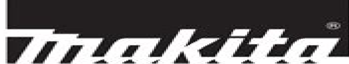
Table Saw Instruction Manual