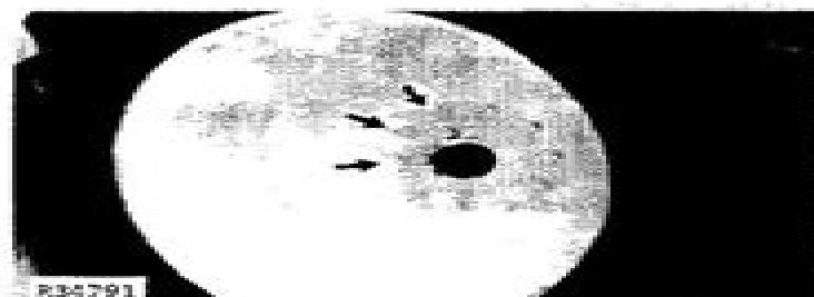
Fig. 16-Rear Wheel Bolts

4. Torque special bolts (B) to 300 ft-lbs (410 N-m) (41 kgm).