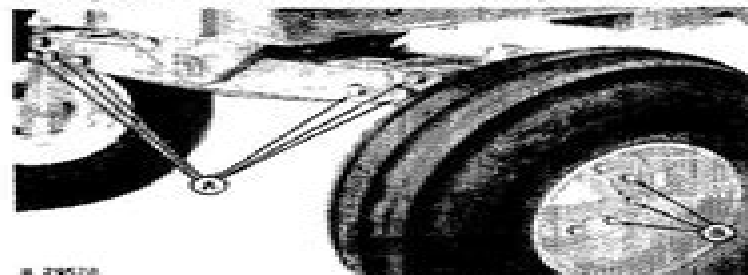
A—Axle Cap Screws

Remove retaining wire from rockshaft lift arms.