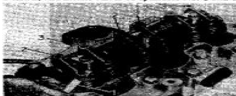
Fig. 8 Adjusting Clearance of the Intake Valve of Cylinder No. 1

Adjust clearance of exhaust valves of cylinders No. 1 and 2, and intake valves of cylinders No. 1 and 3.