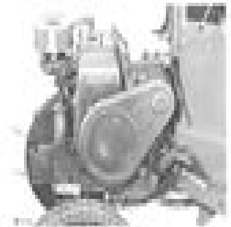
Fig. 13 Crankshaft and Governor - Tractor

Mount linkage between governor arm and take-up spring on governor shaft as indicated, Figure 16.