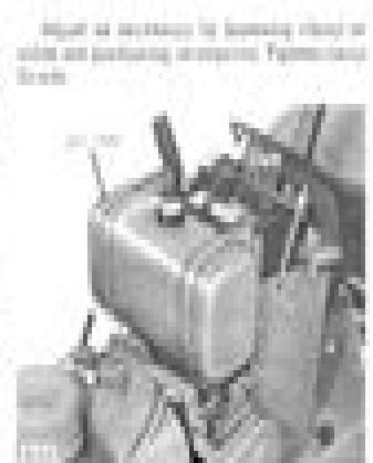
Fig. 17 Crankshaft and Governor - Tractor

Mount chain and throttle cable, Figure 16. Be sure chain is tight when engine is on. Be sure chain is tight when engine is on. Be sure chain is tight when engine is on.