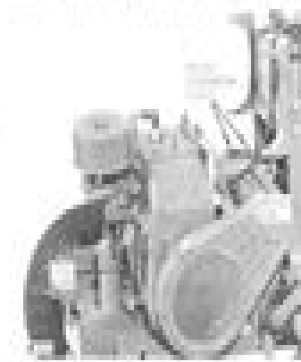
Fig. 15 Crankshaft and Governor - Tractor

When operating tractor engine with a throttle all work on take-up spring on governor arm must be done and stopped. Lower take-up spring is mounted on 110 and 112.