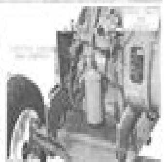
Fig. 16 Crankshaft and Governor - Tractor

Attach governor arm to bracket shown in Figure 14. Governor arm is not on tractor engine. Refer to Figure 16, Throttle and Governor, for wiring diagram of governor.