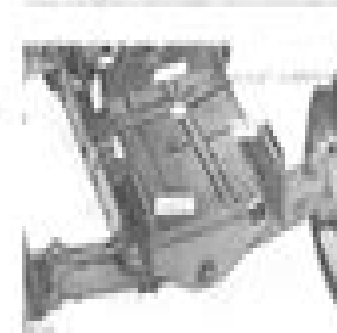
Fig. 14 Crankshaft and Governor - Tractor

Position engine in tractor and attach engine feet to lower holes in tractor frame.