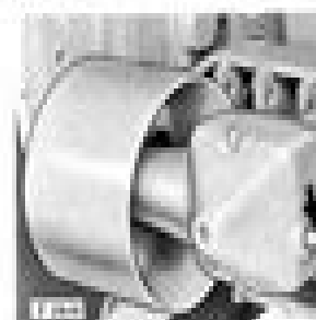
Belt pulley—Oiler oil from side

At the end of 200 hours of operation, the oil in the belt pulley should be checked. To check oil in belt pulley, remove plug on side of pulley housing and fill with SAE 40 multipurpose lubricant to level of filler hole.