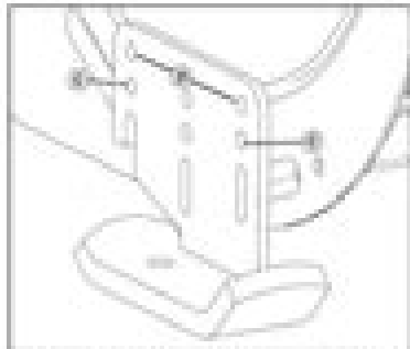
Figure 10-1: Front wheel assembly on side - use position 1 or 2