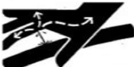
Remove the High-Pressure Hose