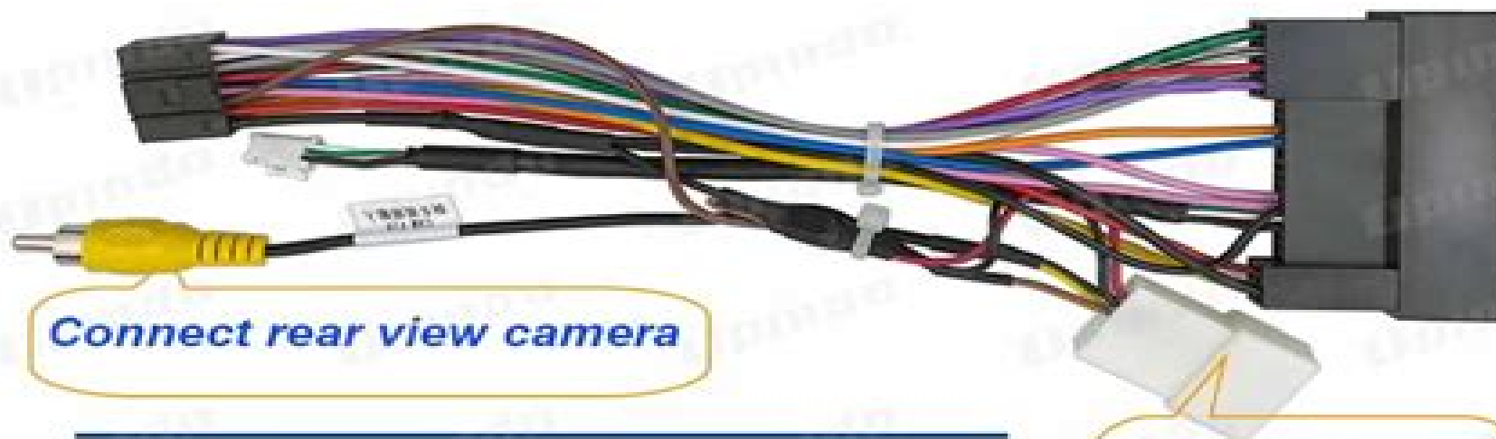
Connect rear view camera