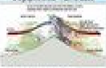
Geographic effect - Sun Shadow