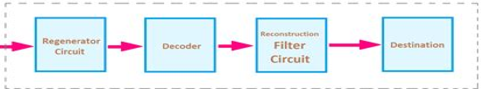
Block Diagram of PCM System