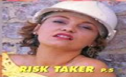
RISK TAKER P.5