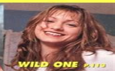
WILD ONE P.102