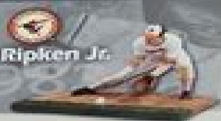
Cal Ripken Jr.