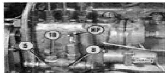
Fig. 61—When tractor is fitted with an injection pump having a pneumatic governor, the fuel pump is bolted to the side of the injection pump as shown.

119. MAXIMUM PRESSURE TEST. With injection pump running at 700