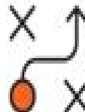
Strategic Thinking and Planning