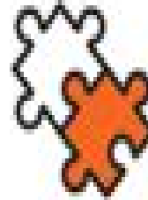
Decision-Making and Problem-Solving Skills