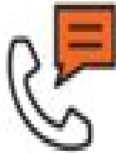
Effective Communication and Positive Attitude