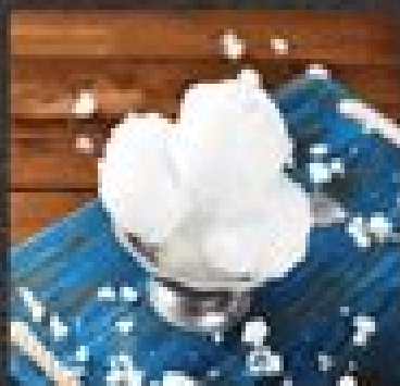
SNOW ICE CREAM