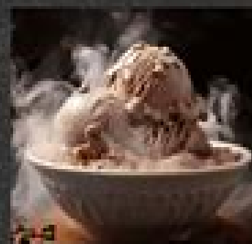
HOT ICE CREAM