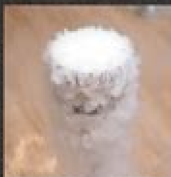
DRY ICE ICE CREAM