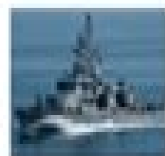
PC-1 Patrol Coastal Ships