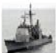
CG-47 Cruisers (Upgraded)