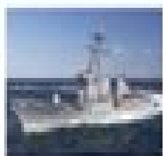
DDG-51 Destroyers (Flight IIA)