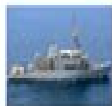
MCM-1 Mine Countermeasures Ships