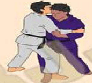
KOUCHI GARI (小内刈)