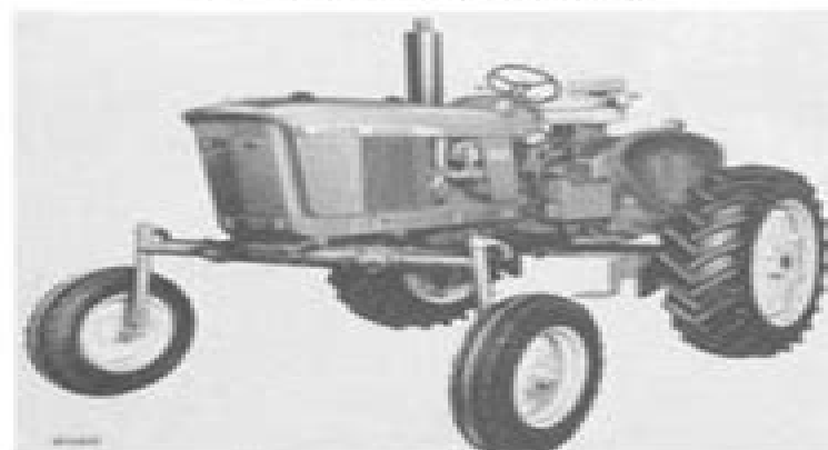
John Deere 3020 Hi-Crop Tractor