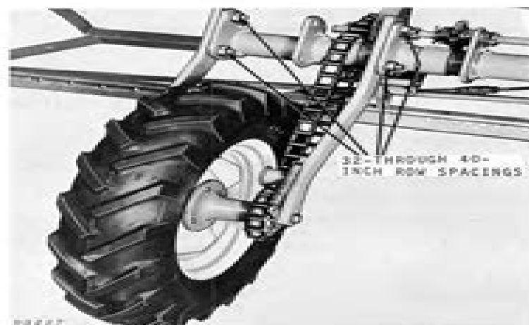
Wheel Setting for 32- through 40-inch Row Spacing

Attach pressure rods to planter frame in appropriate holes as shown above.