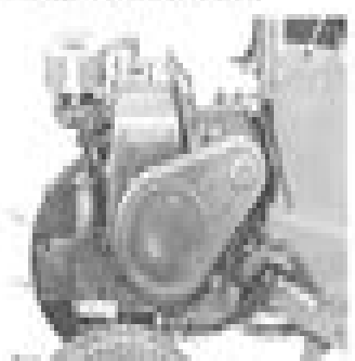
Fig. 16-3 Crankshaft and Governor

Mount linkage between governor arm and crankshaft in correct hole as indicated, Figure 16-3.