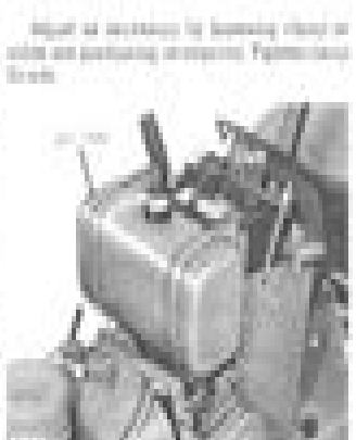
Fig. 16-10 Crankshaft and Governor

Attach governor arm to handle roller as Figure 16-9. Governor arm is not a water pump. Refer to Figure 16-10, Governor Arm, for wiring diagram of governor.