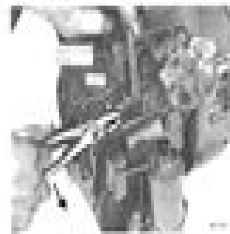
Fig. 16-4 Crankshaft and Governor

Position engine in tractor and attach engine feet to lower holes in tractor frame.