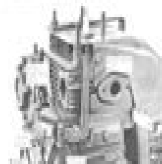
Fig. 16-2 Crankshaft and Governor

These blocks support and slide governor arm, spring, and ball assembly on rear of crankshaft. Be sure spring is positioned into slot in speed control disk.