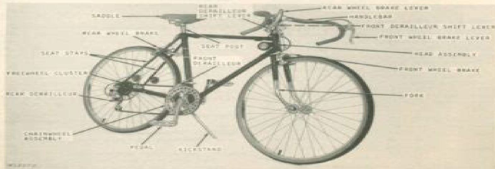
John Deere 10-Speed Bicycle

Your bicycle serial number is stamped on the underneath side of the crank housing. Record this serial number on page 25 to aid in finding your bicycle if it is stolen and to assist you in securing proper parts for service.