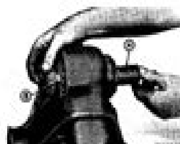
Fig. 12 Pressing Pinion

8. Pack the bearing cones (5, Fig. 14) with John Deere Multi-Purpose Lubricant or an equivalent SAE Multigrade-type grease and press them on the pinion shaft using driver tool (6) as shown in Fig. 4.