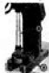
Fig. 10 Pressing Bearing Cover at Pinion

7. Press the oil seal (2, Fig. 12) into the housing (6) with the top of the seal toward the inside. Use driver tool (A) as shown in Fig. 8. The outer edge of the seal should be flush with the housing.