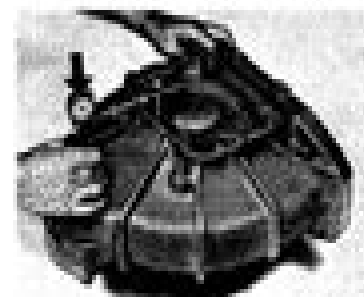
Fig. 14 Checking End Play

10. Install the bearing oil cap (1, Fig. 6) with steel and plastic unions between the cap and housing. Tighten the cap screws to 50-55 ft-lbs (68-75 Nm) torque.