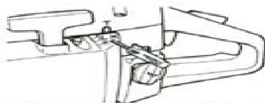
Fig. H40—View showing location of carburetor adjusting points typical of all models. Idle speed screw is at (T), idle mixture screw is at (L) and high speed mixture screw is at (H).

IGNITION. All models are equipped with an electronic breakerless ignition system. Ignition timing is not adjustable and no periodic maintenance is required. Air gap between ignition coil and flywheel should be 0.30 mm (0.012 in.).