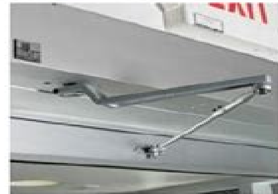
Surface Applied Operator