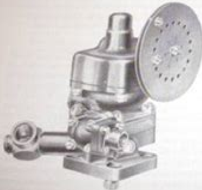
Figure 1—Complete View (Front) of Single Capacity Governor

boosts it to pressure to that required to operate the propeller pitch changing mechanism; a pilot valve actuated by spring balanced fly-weights which controls the flow of oil to and from the propeller; a pressure-operated transfer valve which on feathering installations allows high pressure oil from an auxiliary pump to shunt out the governor when the propeller is being feathered and unfeathered; and a relief valve system which limits the output pressure of the gear pump, yet allows it to provide sufficient operating force to control the propeller under all conditions.