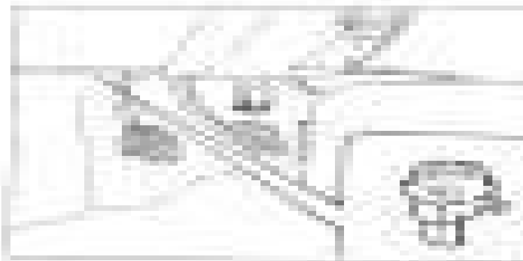
Diagram of a greenhouse showing how light rays are reflected back into the interior, warming the space.

Greenhouse Effect The greenhouse effect is a process by which solar radiation enters the Earth's atmosphere as shortwave radiation and is absorbed by the Earth's surface. The surface then radiates energy back out as longwave radiation. Greenhouse gases in the atmosphere absorb some of this outgoing radiation and re-radiate it in all directions, including back toward the Earth's surface. This process warms the planet and makes life possible. The greenhouse effect is a natural process that warms the Earth's surface. When the Sun's rays hit the Earth, they heat the land and water. The land and water then radiate the heat back out into the atmosphere as longwave radiation. Greenhouse gases in the atmosphere, such as carbon dioxide and water vapor, absorb some of this outgoing radiation and re-radiate it back toward the Earth's surface. This process is called the greenhouse effect and it is what keeps the Earth warm enough for life to exist. The greenhouse effect is a natural process that warms the Earth's surface. When the Sun's rays hit the Earth, they heat the land and water. The land and water then radiate the heat back out into the atmosphere as longwave radiation. Greenhouse gases in the atmosphere, such as carbon dioxide and water vapor, absorb some of this outgoing radiation and re-radiate it back toward the Earth's surface. This process is called the greenhouse effect and it is what keeps the Earth warm enough for life to exist.