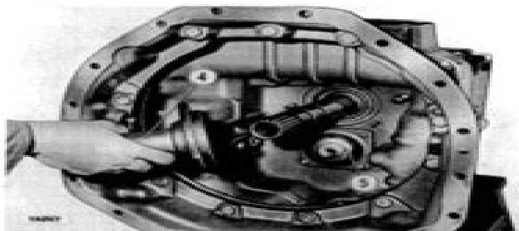
Installing transmission drive shaft cover 4. Drive shaft - 5. Cover.