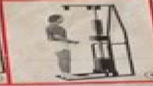
45 Lever les jambes et les maintenir en l'air pendant 10 secondes.