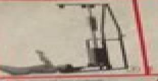
40 Lever les jambes et les maintenir en l'air pendant 10 secondes.