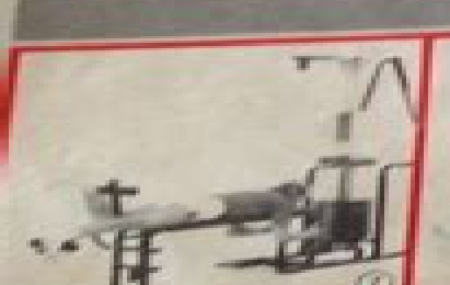
52 Lever les jambes et les maintenir en l'air pendant 10 secondes.