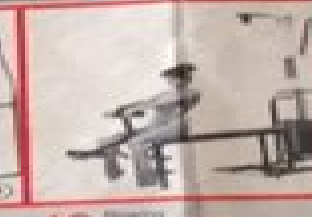
49 Lever les jambes et les maintenir en l'air pendant 10 secondes.