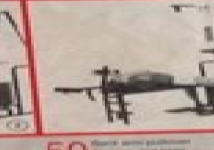
50 Lever les jambes et les maintenir en l'air pendant 10 secondes.