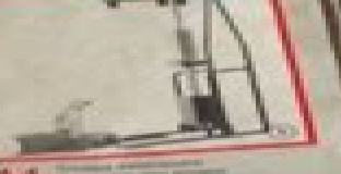
41 Lever les jambes et les maintenir en l'air pendant 10 secondes.