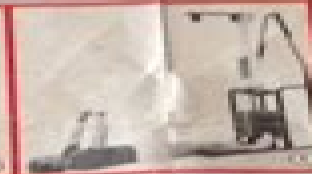
44 Lever les jambes et les maintenir en l'air pendant 10 secondes.