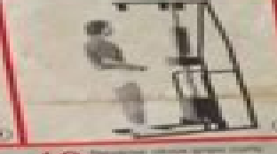
46 Lever les jambes et les maintenir en l'air pendant 10 secondes.