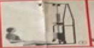
39 Lever les jambes et les maintenir en l'air pendant 10 secondes.