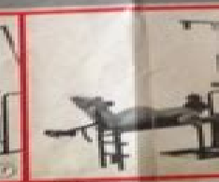
54 Lever les jambes et les maintenir en l'air pendant 10 secondes.