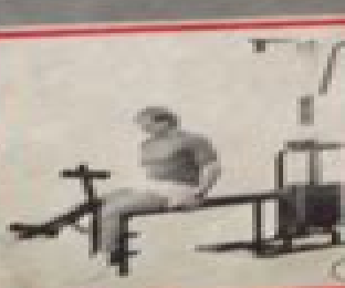
53 Lever les jambes et les maintenir en l'air pendant 10 secondes.