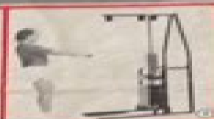
43 Lever les jambes et les maintenir en l'air pendant 10 secondes.