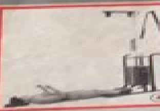
48 Lever les jambes et les maintenir en l'air pendant 10 secondes.