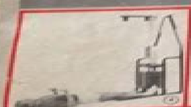
47 Lever les jambes et les maintenir en l'air pendant 10 secondes.