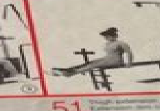
51 Lever les jambes et les maintenir en l'air pendant 10 secondes.