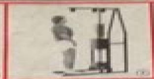
38 Lever les jambes et les maintenir en l'air pendant 10 secondes.