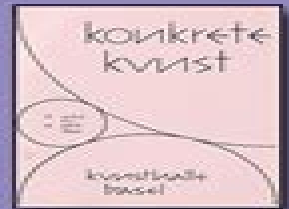
konkrete kunst (1944)