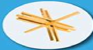
Kern aus doppelungen (1968)