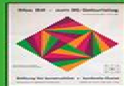
50 ans de Max Bill (1988)