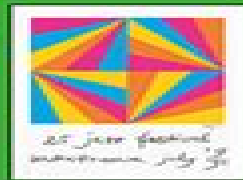
Montreux Jazz (1997)