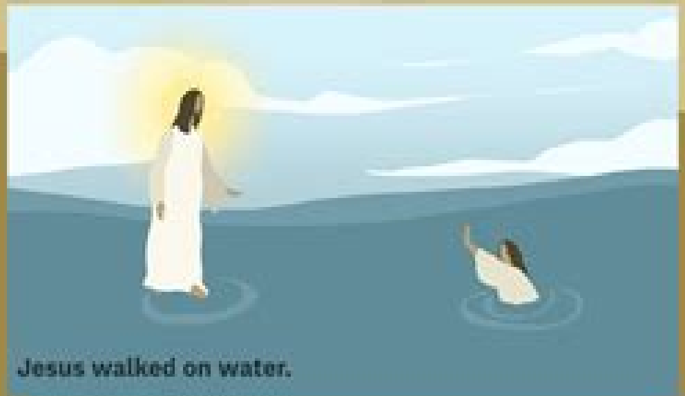
Jesus walked on water.