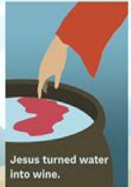
Jesus turned water into wine.