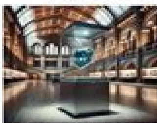
The Star of Azura in the National History Museum