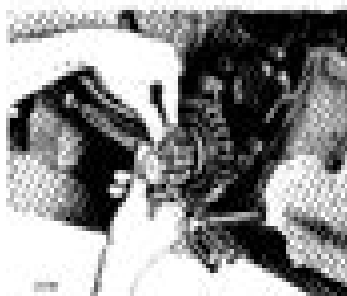
Figure 125-5-1: Input Gear and Thrust Washer

Install input gear (2) and thrust washer (3) in hole in bottom of main case. Make sure that wide portion of washer fits in machined groove in case (Figure 125-5-1).