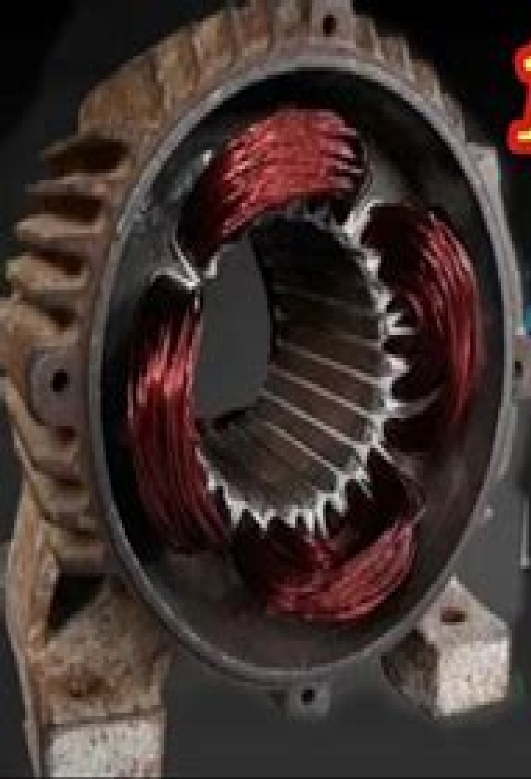
Single Phase, 4 Pole, 24 Slots, 1440 rpm Motor Winding Design