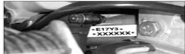
Fig. 2 Engine Identification Number

The engine number is stamped on the crankcase (Fig. 2), and will have the prefix E17...3 followed by 8 characters.