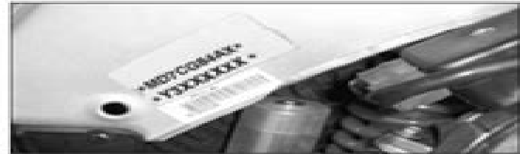
Fig. 1 Chassis Identification Number

The chassis identification number is stamped on the right hand side of the rear portion of the chassis frame (Fig. 1): The first row of this number will begin MD7CG84A.... and the second row will have 8 characters.