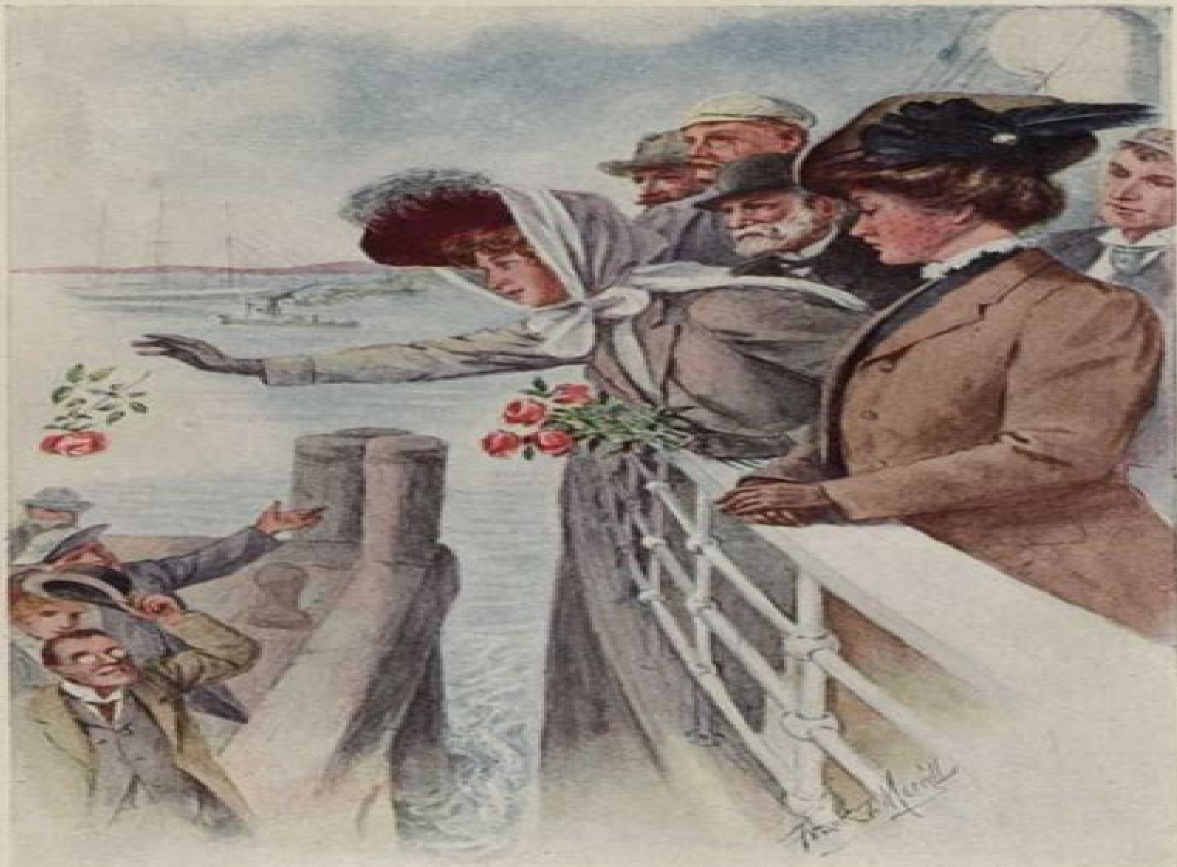
A flower shot down amid the crowd. Page 19.